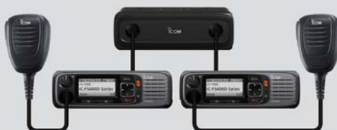
Dual Head Controller* Optional RMK-7, hand microphone and separation cables required.

A detached controller head with the separated RF unit is a simple to install in almost any vehicle.