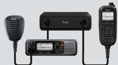
COMMANDMIC™ and Detached Controller* Optional RMK-5, COMMANDMIC, HM-218 and separation cables required.

Suitable for double cab vehicles. Install the controller head to front and rear seats respectively.