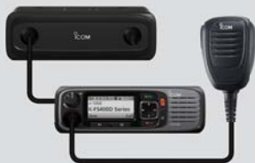
Detached Controller* Optional RMK-5 and separation cable required.

With a combination with optional separation kits, COMMANDMIC and separation cables, three types of controller configurations are available to suit almost any application or installation that may be required. The intercom function is available between controllers and/or COMMANDMIC.